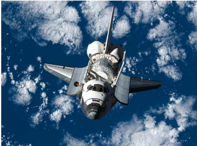
Space Shuttle Discovery

tems and more than 30 laboratories in Moscow, Leningrad, Obninsk, Sverdlovsk, Chelyabinsk, Omsk and Novosibirsk take part in so called “supersensitive arms race” made American Congress worry and allowed to provide new investments into research work. In the further budget projects a share for this purpose was increased up to USD 450 million per annum.