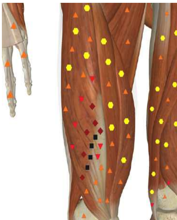
Fig. 1. NLS-graphy of lower extremity. Transverse rupture of right rectus muscle of thigh.

versal. Longitudinal traumas are more frequent, easily diagnosed and treated. NLS-graphically hematomas and synoviomias are visualized in a trauma spot. At transversal bruises and ruptures NLS-picture is polymorphic due to atypical traction and muscular ischemia, and that complicates diagnostics essentially.