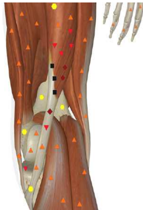
Fig. 3. NLS- graphy of lower extremity. Pathological traction, at transverse rupture of right semitendinosus muscle of thigh.

of further damages of a muscle, resulting in restriction of sports activities. This fact specifies the importance of NLS-research in diagnostics of a muscular trauma in sportsmen.